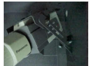
Larger camera & lens combination shown inside a CMH02

Specifications subject to change without notice