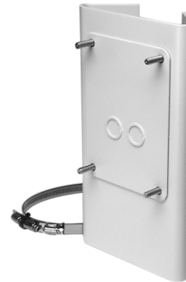
PA402 SHOWN WITH REMOVABLE BLOCK-OFF PLATE

The PA402 is a pole mount adapter designed for use with Spectra® and Legacy® wall mounts. For Spectra, DF5, or DF8 Series pendant domes, use the IWM Series and IDM4018 wall mount. For Legacy positioning systems, use the LWM41 wall mount.